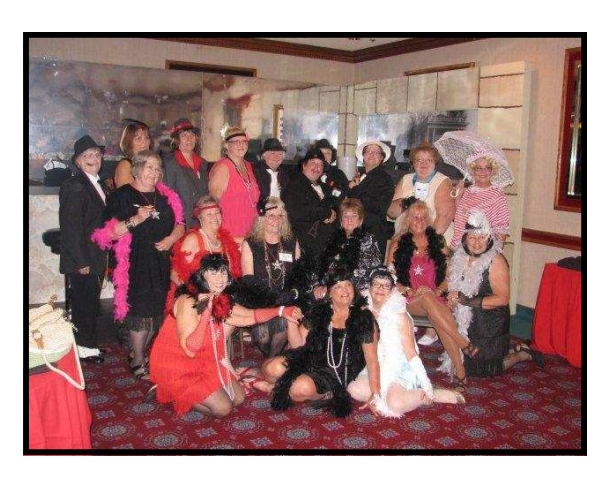
The Grand Gatsby Speakeasy guests